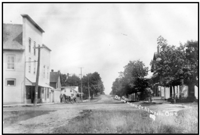
Newboro's Drummond Street as it was in wild past. But ne'er a gunfight at the OK Canal! Now the streets of Newboro are paved, but not with gold

"provinces" as you've done since leaving Newboro. Cross the valley of Loughborough Lake, once a seething spillway of a melting ice sheet. Convenience stores in Inverary.