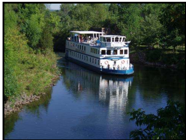
Kawartha Voyageur in the Newboro Channel