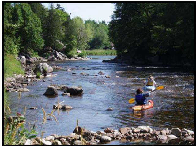
Playing in the Playfair Rapids on Canada's magical Mississippi River.

Km. 57.0 (44° 00.955'N. 76° 21.752'W.) At STOP Sign, turn right in village of Lanark, a Scottish heritage mill town once using the might of the Clyde River. Wide variety of shops and services including nearby Community Health Centre.