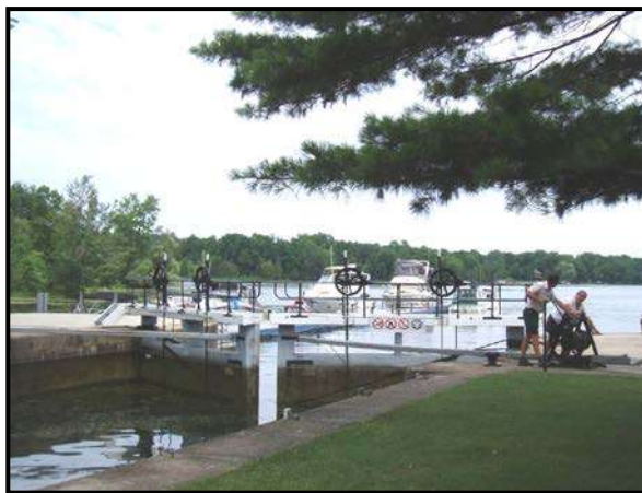
Opening the gate at Narrows Lock into the realm of Big Rideau Lake

Here, you are also crossing the Rideau Lakes Fault Line, especially evident in the cliffed north shore of the Upper Rideau between the Canadian Shield to your north and the St. Lawrence plain to your south.