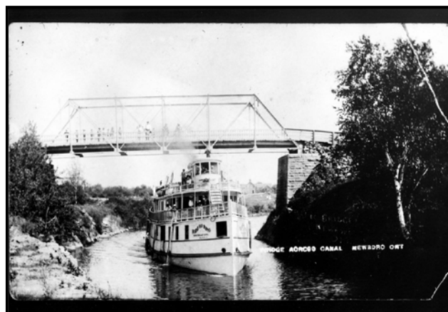
Rideau Queen in the Newboro Channel. From here, the only way is down to Ottawa or Kingston.