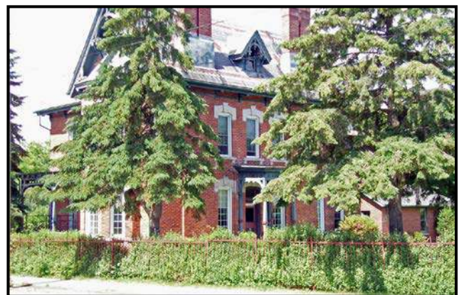
The J.T. Gallagher House (c1885), one of many stately heritage homes in Newboro