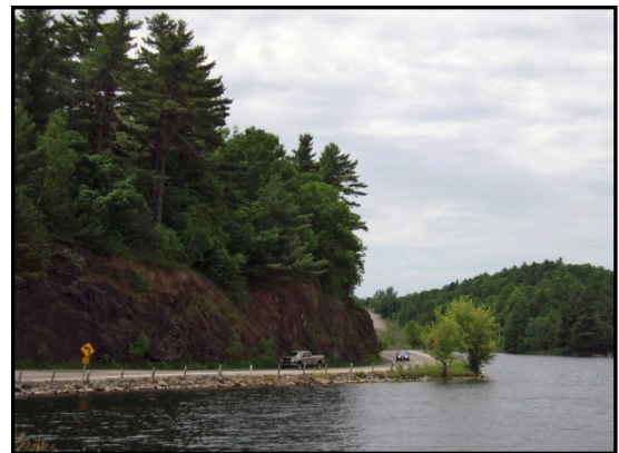
The road clings to the cliffs along the shore of Wolfe Lake

Km. 96.2 (44° 37.260'N. 76°23.682'W.) Before you get to Bedford Mills, turn left (easterly) onto Hutchings Rd. toward Newboro