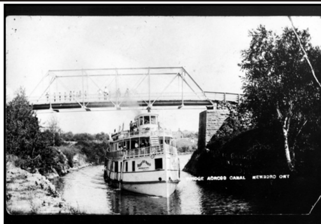
Rideau Queen in the Newboro Channel. From here, the only way is down to Ottawa or Kingston.