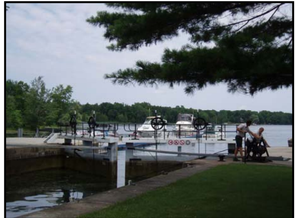
Opening the gate at Narrows Lock into the realm of Big Rideau Lake

Here, you are also crossing the Rideau Lakes Fault Line, especially evident in the cliffed north shore of the Upper Rideau between the Canadian Shield to your north and the St. Lawrence plain to your south.