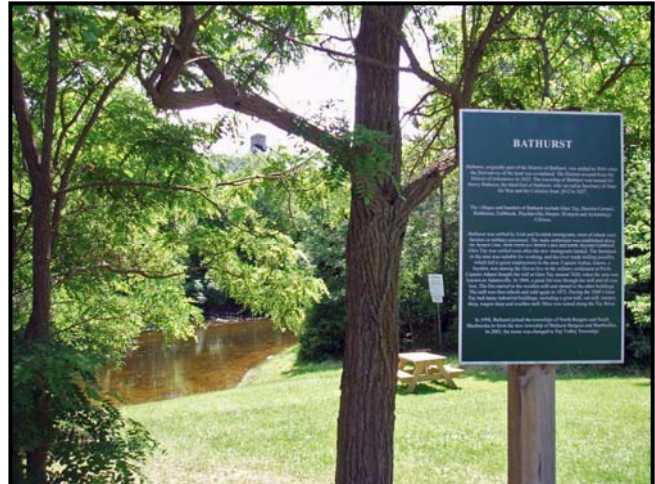
Bathurst Plaque, Tay River and historic Glen Tay Mill in background

Km. 51.5 (44° 51.853'N. 76° 17.118'W.) Turn Right (South-westerly) onto County Rd. 10 , otherwise known as Scotch Line, part of the Rideau Heritage Route. Prosperous modern farms. Flat land, rectangular fields. Deep fertile soils left by the recent Ice Age on St. Lawrence plains sedimentary rocks. Come back for some golf.