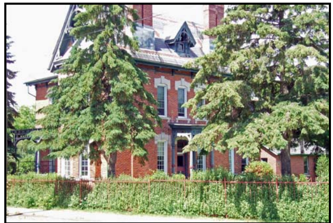
The J.T. Gallagher House (c1885), one of many stately heritage homes in Newboro